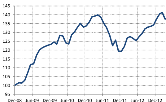
— MFM Convertible Bonds Opportunities (EUR) A