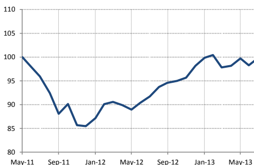
— MFM Convertible Bonds Opportunities (USD) A