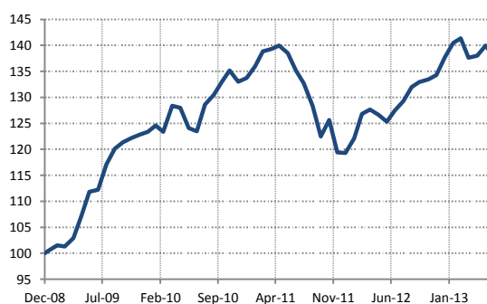
— MFM Convertible Bonds Opportunities (EUR) A