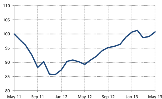
MFM Convertible Bonds Opportunities (USD) I